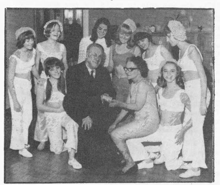
Presenting the proceeds of a Charity Cabaret evening in 1968.

We congratulate the Dore School of Theatre Dance on attaining it's Silver Jubilee and wish it well for the next 25 years.