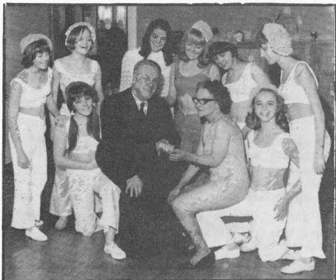
Presenting the proceeds of a Charity Cabaret evening in 1968.

We congratulate the Dore School of Theatre Dance on attaining it's Silver Jubilee and wish it well for the next 25 years.